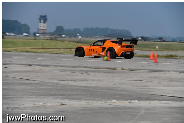
Dallas Reed won XB at the Peru National Tour